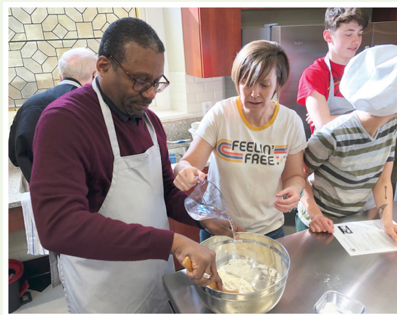
(Above and on page 1) During their retreat in March, members of Session baked bread together and shared stories about what energizes them as leaders.