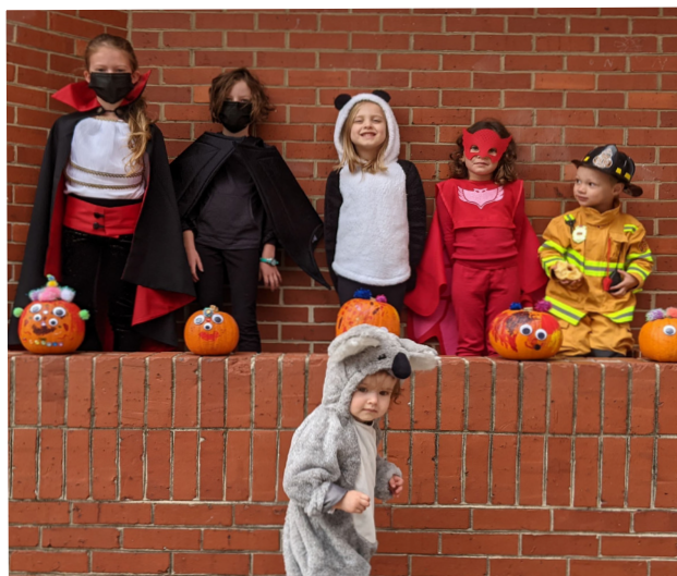
Children's Sunday School on Halloween.

Annual Sunday when the youth of Brown Memorial lead the morning service. The offering this Sunday will go towards funding scholarships for summer trips to Montreat Camp and Conference Center and the Pejutazizi Family Learning Camp and Massanetta Springs Camp and Conference Center. Stay for the in person and break out room 'reception' afterwards to celebrate our middle school and high school members.