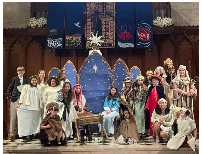
ANNUAL CHRISTMAS PAGEANT

December also saw another major milestone in BUILD's community work, announcing an historic agreement between BUILD, Mayor Scott, and the Greater Baltimore Committee (GBC). The agreement outlines the scale of the housing problems in Baltimore City, the pathway toward securing $3 billion in public investment, and the steps that all parties need to take in order to set the stage for a 15 year rebuild of the city, guided by the principles of community-led development and no displacement. Governor Moore's proposed budget responded to the plan with new revenues that serve as a downpayment toward the plan.