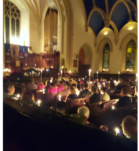
CHRISTMAS EVE WORSHIP