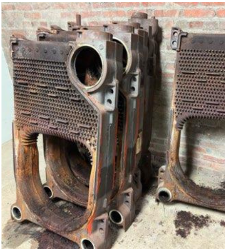
THE OLD BOILER HAD TO BE REMOVED IN PIECES