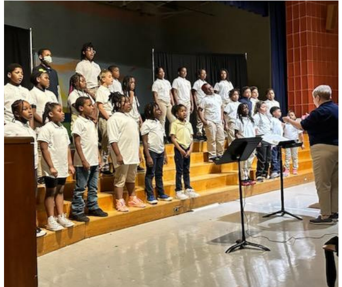
EMES CHOIR REHEARSAL

MAY: The closing of Eutaw Marshburn Elementary School also brought an end to the EMES Choir, an outreach program begun in 2012 which featured weekly choir rehearsals along with homework assistance. Over the years the choir regularly sang at neighborhood events and was once the featured choir at a fundraiser for the Upton/Druid Heights Community. In addition to their Winter and Spring school concerts they also gave a yearly concert each May in the sanctuary.