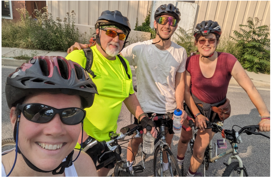
BICYCLING WITH THE FAMILY