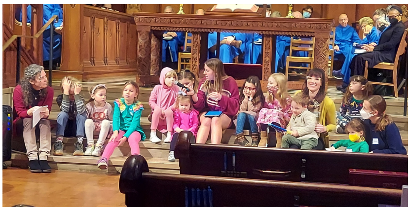
TIME WITH CHILDREN YOUTH SUNDAY