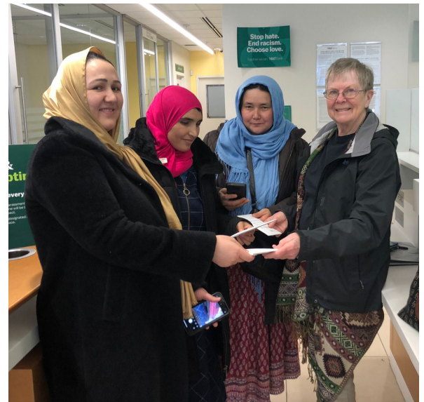
AFGHAN WOMEN BEYOND HOUSEWORK BAZAAR... DEPOSITING THE PROCEEDS!