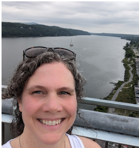
WALKWAY OVER THE HUDSON