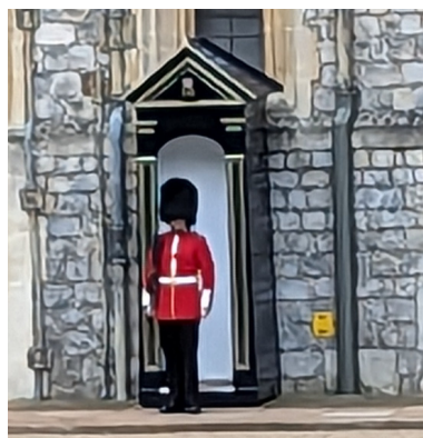
WINDSOR, CASTLE WITH FRIENDS