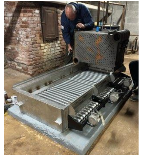
INSTALLING THE NEW