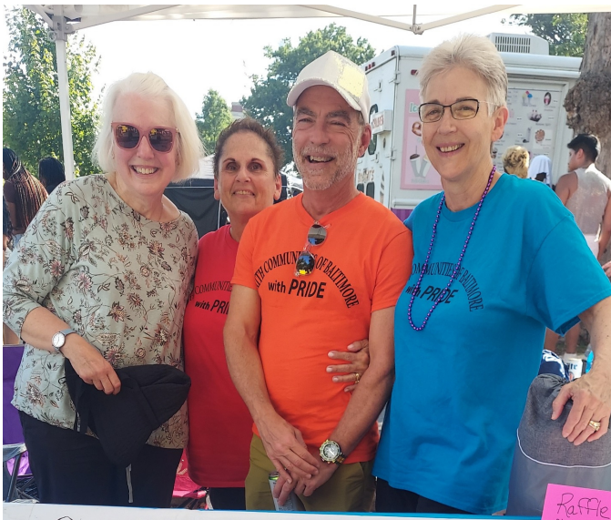
ANNUAL PRIDE PARADE

JULY: In mid-July, our middle school youth traveled with the Presbytery of Baltimore to the annual Middle School Conference at Massanetta Springs in Harrisonburg, VA. Later in the month our high school youth headed to North Carolina for the Montreat Youth Conference.