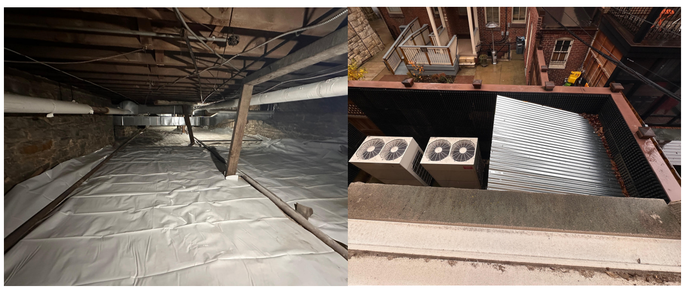
Crawl space under the Sanctuary after abatement.